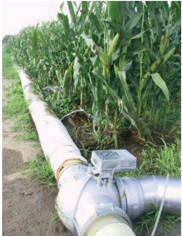
Figure 3. Two automatic surge flow valves manufactured in the United States.