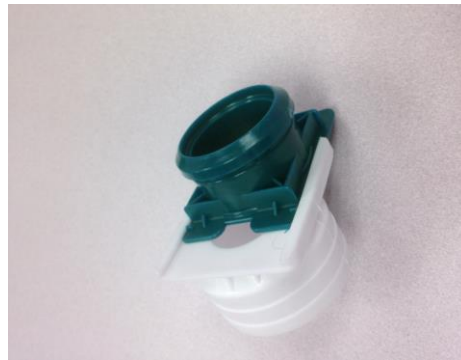
Plastic adjustable gate used with polypipe.

Surge is used with either gated aluminum pipe or polypipe. If using polypipe, it is important that the holes be punched precisely to achieve the targeted furrow stream size (gpm per furrow). Polypipe manufacturers have on-line guides and special hole punchers that will allow you to do this. Another alternative when using polypipe are insertion gates which pop into the punch holes which can be adjusted like aluminum gated pipe.