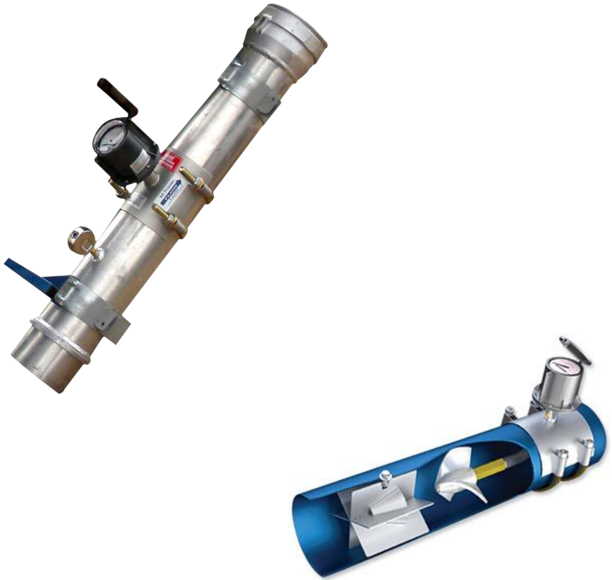
Figure 5. Portable flow test meter with a quick connector for easy insertion into existing pipelines or alfalfa valves.

These portable test meters can be ordered with handles, straightening veins to improve accuracy, and a pressure gauge. Usually, a smaller pipe-size than the existing pipeline is used to ensure a full pipe in the test meter.