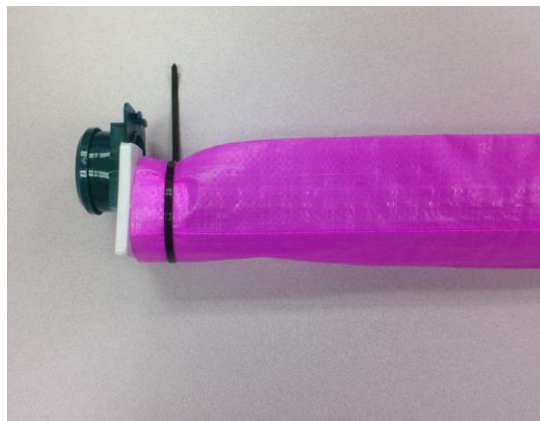
Polypipe insertion gate shown with sleeve to reduce erosion at the head of the furrow.

Figure 4. Recommended insertion gates and sleeve when using polypipe for furrow irrigation.